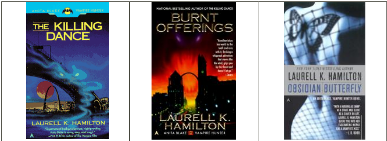
Book covers from Amazon.com.

always ends badly for the humans. It's a rule" ( Circus of the Damned 328).